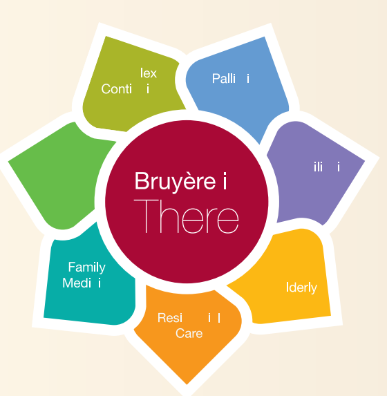
Annual Report 2013-14